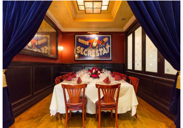
La Salle de Famille

A cozy room at the rear of our restaurant, which comfortably accommodates up to 12 guests. Velvet curtains at the entrance of the room may be kept open or closed depending on your privacy needs.