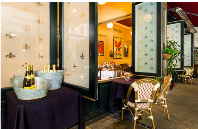
La Salle de Amis & the Petit Patio