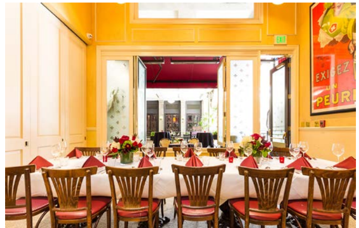
Front Half of La Salle de Amis