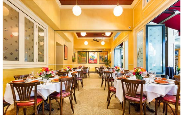
La Salle de Amis

Also, we work with a local audio & visual equipment company to provide your group with the necessary items for your event. From a screen and projector to a laptop, we can acquire anything you may need for your presentation.