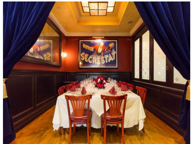
La Salle de Famille

A cozy room at the rear of our restaurant, which comfortably accommodates up to 12 guests. Velvet curtains at the entrance of the room may be kept open or closed depending on your privacy needs.