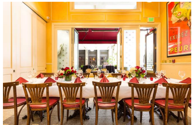
Front Half of La Salle des Amis