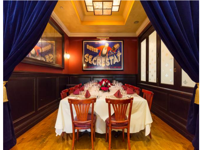
La Salle de Famille

A cozy room at the rear of our restaurant, which comfortably accommodates up to 12 guests. Velvet curtains at the entrance of the room may be kept open or closed depending on your privacy needs.