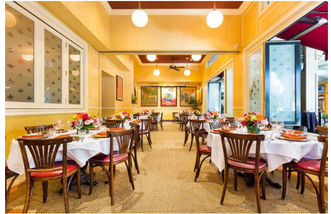
La Salle des Amis

Also, we work with a local audio & visual equipment company to provide your group with the necessary items for your event. From a screen and projector to a laptop, we can acquire anything you may need for your presentation.