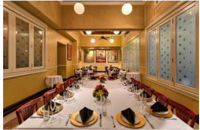
La Salle des Amis

Also, we work with a local audio & visual equipment company to provide your group with the necessary items for your event. From a screen and projector to a laptop, we can acquire anything you may need for your presentation.