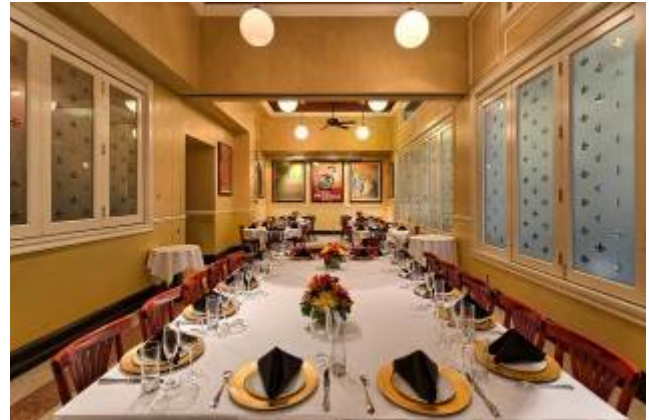
La Salle des Amis

Also, we work with a local audio & visual equipment company to provide your group with the necessary items for your event. From a screen and projector to a laptop, we can acquire anything you may need for your presentation.