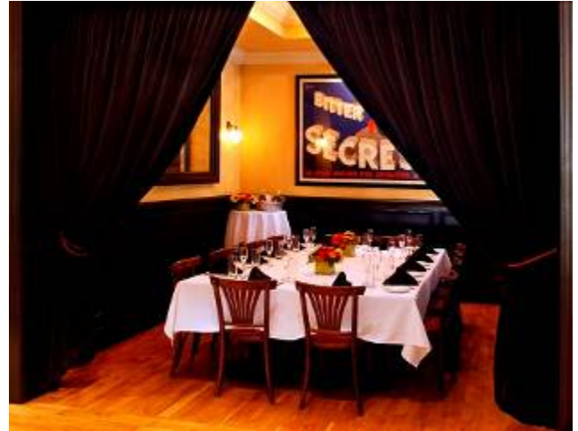
La Salle de Famille

A cozy room at the rear of our restaurant, which comfortably accommodates up to 12 guests. Velvet curtains at the entrance of the room may be kept open or closed depending on your privacy needs.