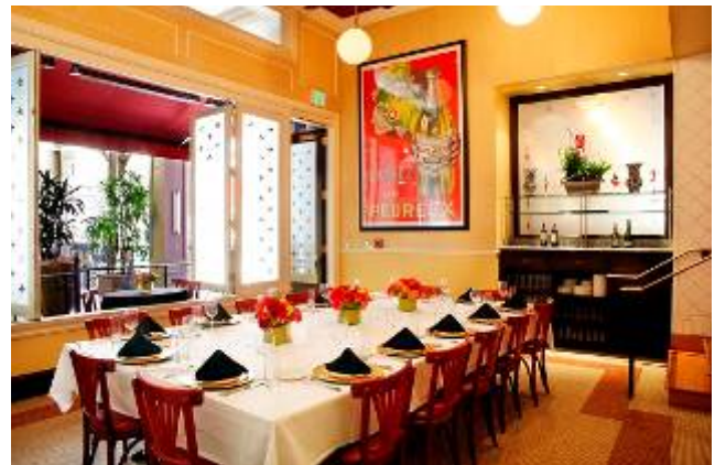
Front Half of La Salle des Amis