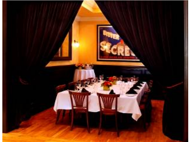
La Salle de Famille

A cozy room at the rear of our restaurant, which comfortably accommodates up to 12 guests. Velvet curtains at the entrance of the room may be kept open or closed depending on your privacy needs.