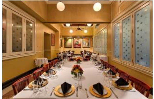
La Salle des Amis

Also, we work with a local audio & visual equipment company to provide your group with the necessary items for your event. From a screen and projector to a laptop, we can acquire anything you may need for your presentation.