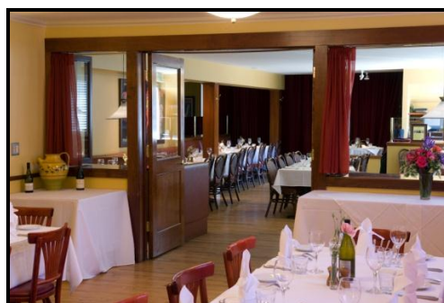
Salle Des Amis looking into Grand Salon fits up to 75 seated