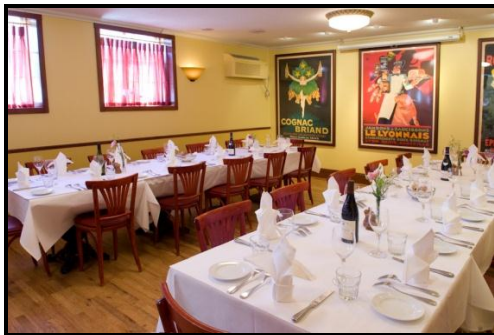
Salle Des Amis fits up to 35 seated