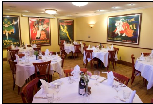
Salle Des Amis fits up to 35 seated